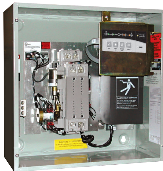
ZTX Series Residential & Light Commercial Switch with LED Control Panel (cover removed)

All time delays are fixed (non-adjustable).