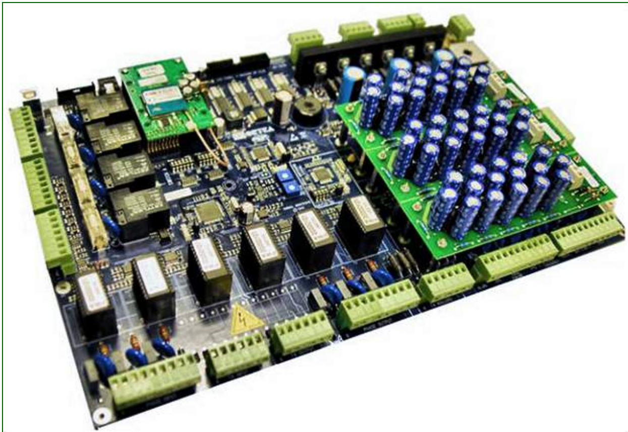
New generation multi-purpose control board fitted with two DSP microprocessor, bodyguard microprocessor and GPRS modem

Further details in the technical data tables